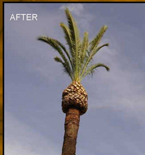
Example of Improper Pruning